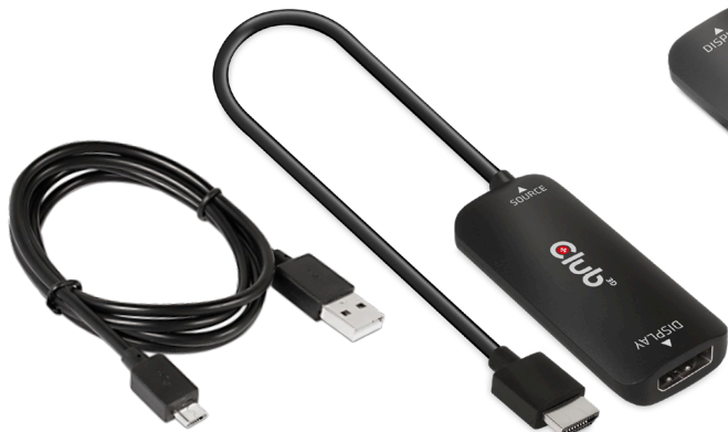
CAC-1335 + USB A to Micro USB Power Cable 1 m/3.28 ft

** Connect a power adapter or computer to the USB Type A plug to supply power for the adapter. Please check whether your external power source supports 5V / 1.5A (7.5W).