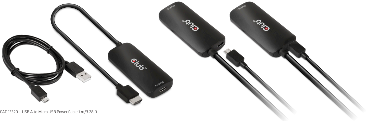
CAC-13320 + USB A to Micro USB Power Cable 1 m/3.28 ft

Note: This adapter will only work on USB Type-C Displays that are self powered !